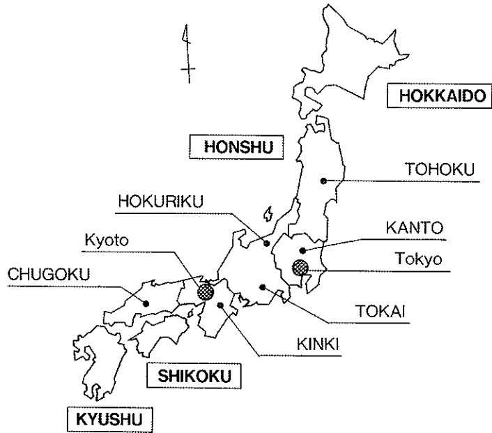
Fig.1. A map of Japan showing the large islands and districts.