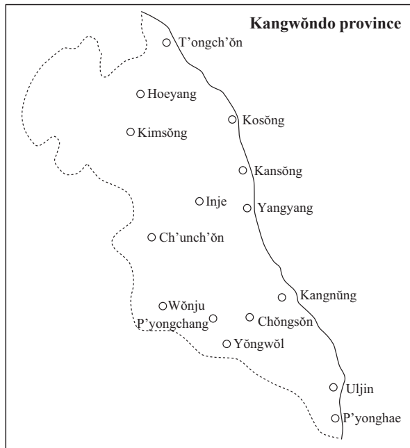
Note: The counties indicate where kempei detachments, out stations, and police stations were located.