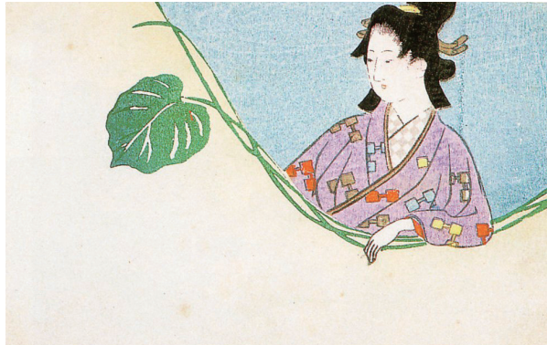
Figure 3. “Hidden shunga ,” 1904–1906. Ishiguro Keishō 石黒敬章 Collection. Image reproduced from Taiyō 424.

postcard (Figures 3 and 4). Postcards of the time were made by pasting together two or three sheets of thin paper, and the trick was made possible by printing the erotic image on an inner layer. 44