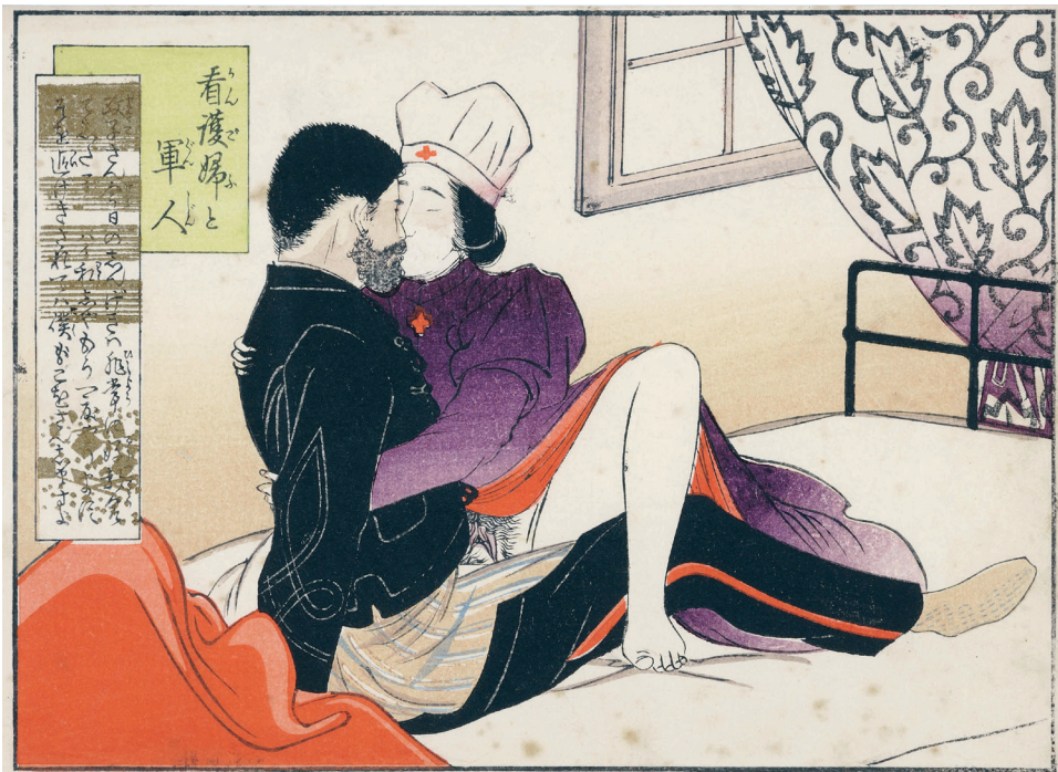
Figure 1. Nurse and soldier. 1893–1912.