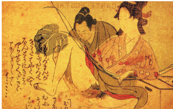
Figure 4. “Hidden shunga ,” 1904–1906. Ishiguro Keishō Collection. Image reproduced from Taiyō 424.

While this new genre of shunga was being developed, production continued of shunga and shunpon with traditional, Edo period contents and format. As mentioned previously, large scale arrests relating to shunga were carried out from 1905 to 1909, and the confiscated items included many printing blocks. This shows that, until that time, shunga and shunpon were being produced by woodblock printing. Incidentally, the Asabi shinbun of 1906 carried a detailed list of confiscated evidence: 45