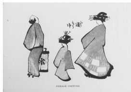
Female costume 女の服装[花魁道中]

Original caption and Japanese translation