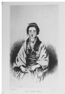
The village beauty 村の美人

Original caption and Japanese translation