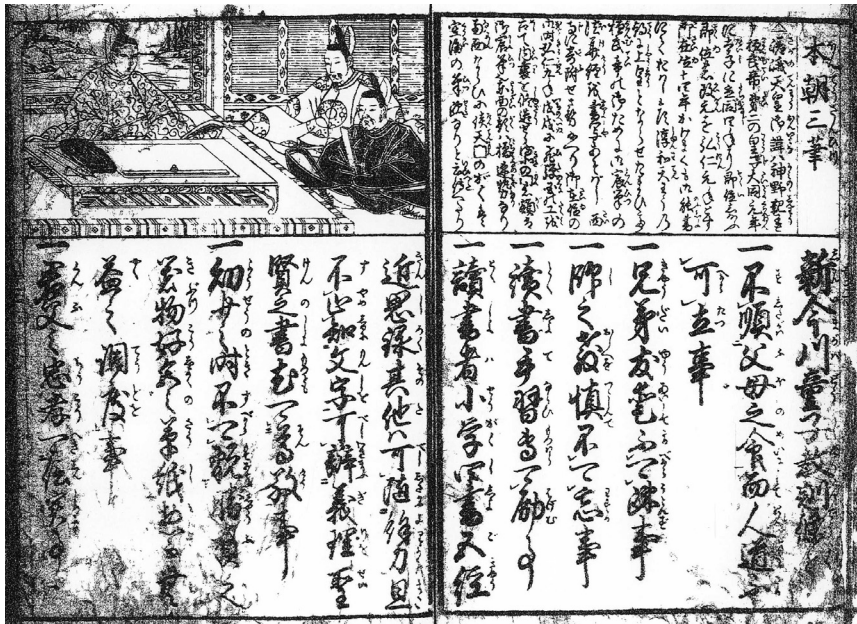
Figure 5a. “Honchō Sanpitsu” 本朝三筆 (Famous Calligraphers): Emperor Saga 嵯峨天皇, Kōhō Dai-shi (Kūkai) 弘法大師 (空海), Tachibana no Hayanari 橘の逸勢, Shindōji ōrai bansei hōzō . Okamura Kintarō Collection.