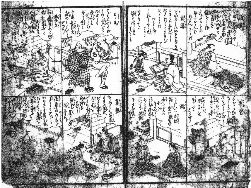
Figure 4a. “Shogei eshō” 諸芸絵抄 (Illustrations of Examples of Children Learning Skills). Shindōji ōrai bansei bōzō . Okamura Kintarō Collection.