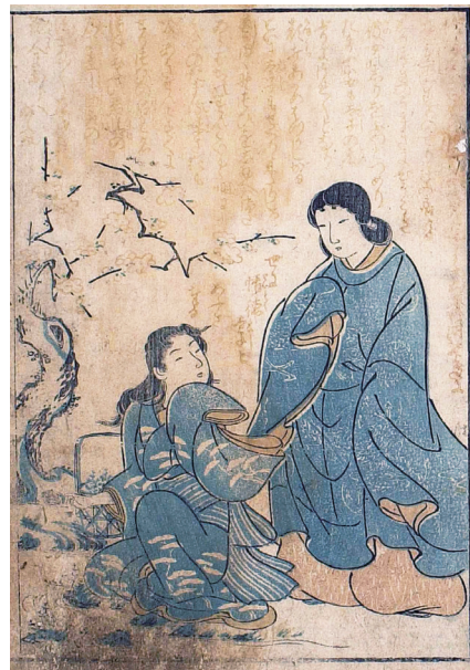
Figure 1b. Shōtoku (“Jōtoku” or “Seitoku,” meaning “passionate”) Taishi 情徳太子 in a field with a girl and the text says he is pinching her bottom. Makura dōji nukisashi manben tamaguki . International Research Center for Japanese Studies.