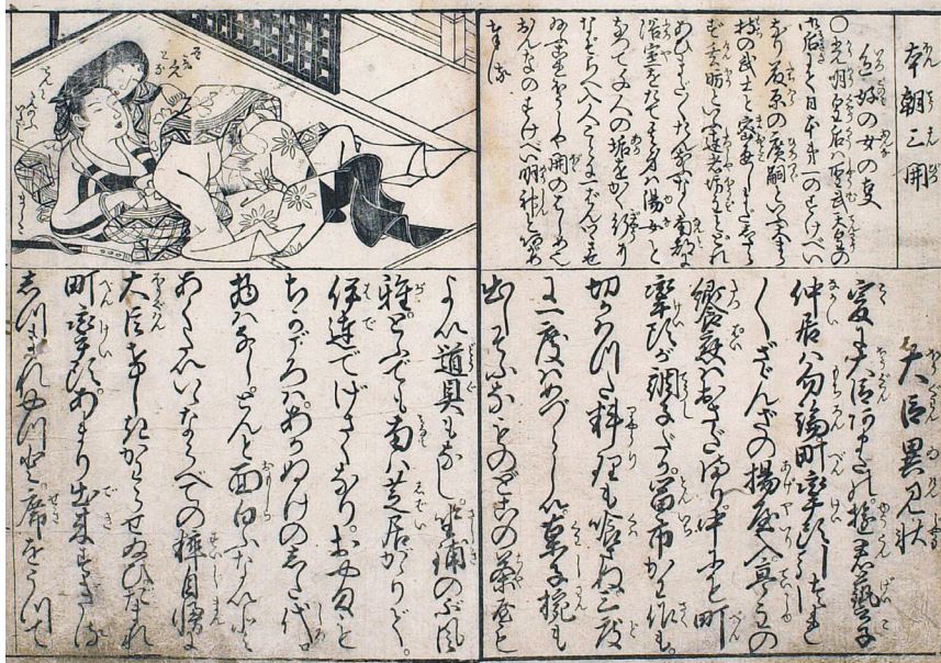
Figure 5b. “Honchō sanpitsu” 本朝三開 (The Three Great Pussies of the Realm): Empress Kōmyō 光明皇后. Makura dōji nukisasabi manben tamaguki . International Research Center for Japanese Studies. The text explicitly states: “Kōmyō was Emperor Shōmu’s Empress and was the greatest lecher in all Japan” 光明皇后は聖武天皇の御后にて、日本第一のすけべいなり。The text finishes by saying that she is the “goddess of horny women” ( onna no sukebei myōjin おんなのすけべい明神). Her words in the image are: Kōmyō: “Wha... I’m exhausted! And I finally feel satisfied.”