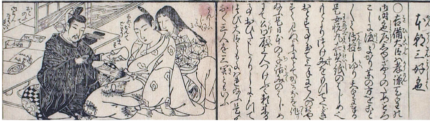
Figure 6b. “Honchō sankōshoku” 本朝三好色 (The Three Great Lovers of the Realm): Kibi no Makibi 吉備真備, Kōbō Daishi 弘法大師, Ariwara no Narihira 在原業平. Makura dōji nukisashi manben tamaguki . International Research Center for Japanese Studies. The text says that Kibi no Makibi was sent to China by Empress Kōken to learn about the way of sex ( shikidō shugyō 色道しゆぎょう), and brought back a medicine to increase a woman’s pleasure in orgasm, which he presented to her; this is the beginning of nyo’etsu gan 女悦丸 (a popular Edo period aphrodisiac).