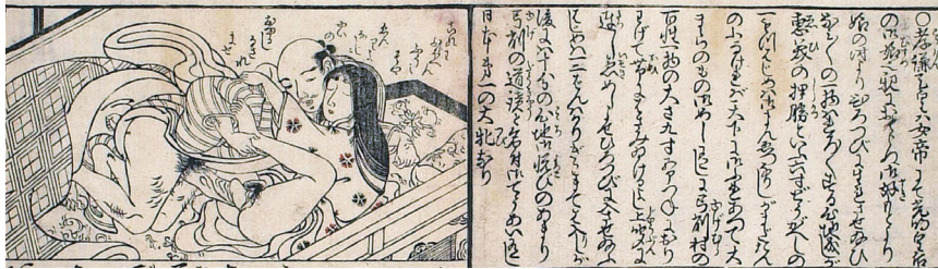
Figure 5c. “Honchō sanpitsu” 本朝三開 (The Three Great Pussies of the Realm): Empress Kōken (Empress Shōtoku) 孝謙天皇 (称徳天皇) with the Priest Yuge no Dōkyō 弓削の道鏡. The dialogue in the picture says: Kōken: “Never had a man this good before. Don’t hold back, let me have it all.” Dōkyō: “Please forgive me Your Highness.”