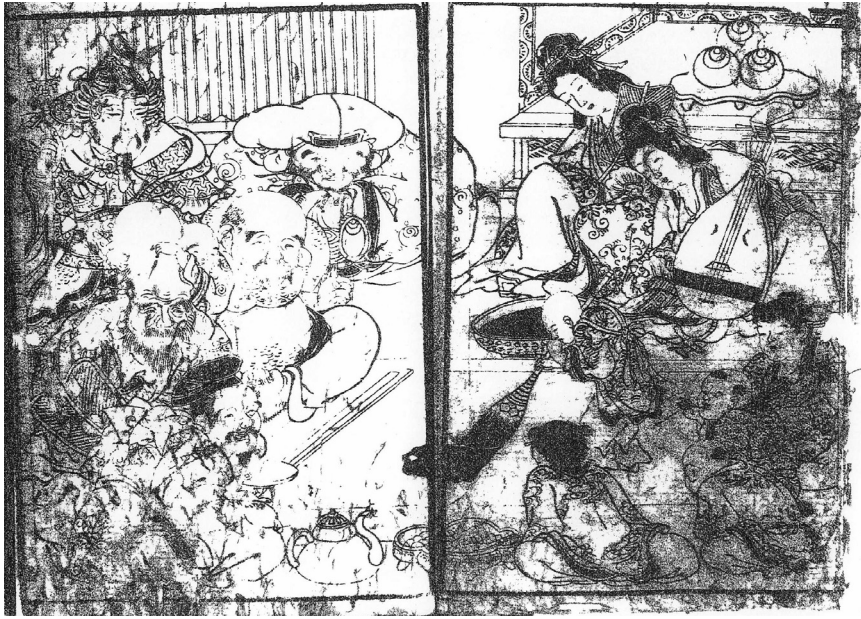
Figure 2a. “Shichifukujin kichisho-zu” 七福神吉書図 (Seven Gods of Good Fortune): Daikokuten 大黒天, Ebisu 恵比寿, Bishamonten 毘沙門天, Benzaiten 弁財天, Fukurokuju 福祿寿, Jurōjin 寿老人, Hotei 布袋. Shindōji ōrai bansei bōzō .