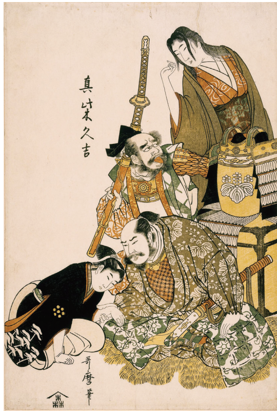
Figure 8. Mashiba Hisayoshi . By Kitagawa Utamaro, c. 1803–1804. Collection of the British Museum.

How was this anarchic satirizing of traditional Japanese historical figures received before the modern era? It is not an easy matter to gauge the impact of popular culture on social and personal ethics. One way to judge whether popular works were viewed as subversive by the government, of course, is to determine if they were censored or banned. Shunga books were already officially censored, so below the radar, but much less explicit works either in sexual terms or in political terms were banned and the offenders arrested. Examples include the kibyôshi (comic illustrated fiction) of Koikawa Harumachi, who was arrested and died in prison in 1789, 23 and later in 1804, the ukiyo-e prints of Utagawa Toyokuni (1769–1825) and Kitagawa Utamaro (1753–1806), who were arrested along with publishers around what is termed the “Ehon Taikôki” incident. 24 Illustrated books and prints depicting the figure of Toyotomi Hideyoshi (1536–1598) flourished