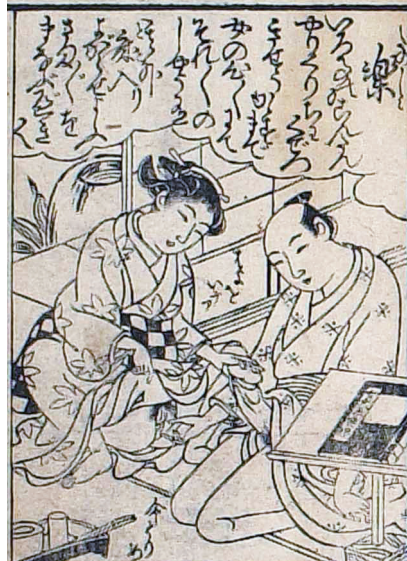
Figure 4c (detail). Onna dairaku takara-beki used as a textbook for learning about sex. After listening to the man's talk on what one needs to learn about sex, the woman says: "Hurry up and get on with it!" (女「はよせいナア」); Man: "You'll be the death of me yet!" (男「命とりめ」). International Research Center for Japanese Studies.