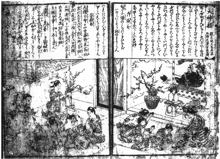
Figure 3a. “Tenjin kyō” 天神経 (Teachings of Heaven [or] Wisdom of Sugawara Michizane), showing lessons for boys, with older women helping. Shindōji ōrai bansei hōzō .