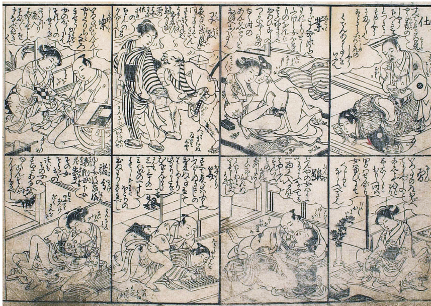
Figure 4b. Illustrations of Learning about Sexual Matters. Makura dōji nukisashi manben tamaguki . International Research Center for Japanese Studies.