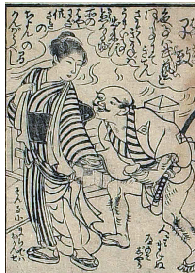
Figures 4d (left) and 4e. Details from Shindōji ōrai and Makura dōji . Comparison of drawings of men in the original and in the parody. The male figures on the right both show one of Shunchōsai's distinctive facial types, with a pointed chin. The woman in 4e banters back to the man, that she "wouldn't be interested in a man with such a small penis." Collections of Okamura Kintarō and International Research Center for Japanese Studies.