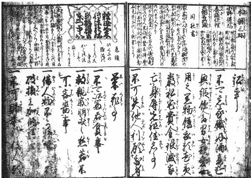
Figure 6a. “Honchō sanseki” 本朝三跡 (Famous Calligraphers of the Realm): Ono no Tōfū 小野道風, Fujiwara no Sukemasa 藤原佐理, Fujiwara no Yukinari 藤原行成. Shindōji ōrai bansei hōzō . Okamura Kintarō Collection.