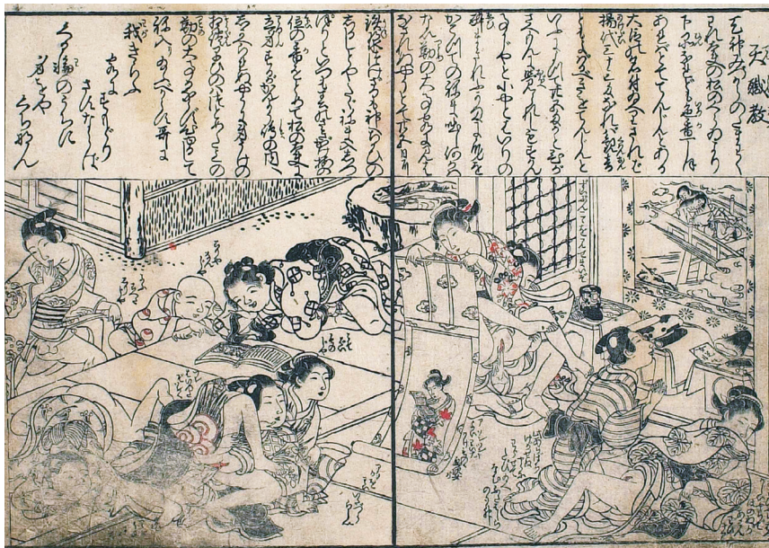
Figure 3b. “Tenshoku kyō” 天職教 (Teachings of a Tenjin Courtesan), showing boys and girls exploring sexual knowledge on their own. Makura dōji nukisashi manben tamaguki . International Research Center for Japanese Studies.