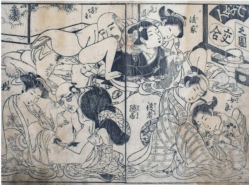
Figure 2b. “Shichi kōjin kōgō no zu” 七好人交合の図 (Seven Amorous Types): Widow goke 後家, catamite wakashudō 若衆道, monk bōzu 坊主, mistress mekake 妾, old codger inkyō 隠居, actor yakusha 役者, courtesan jorō 女郎. Makura dōji nukisashi manben tamaguki . International Research Center for Japanese Studies.