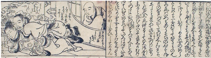
Figure 6c. Kōbō Daishi (Kūkai) and his discovery of male-male sex in China. Makura dōji nukisashi manben tamaguki . International Research Center for Japanese Studies. The text says that Kōbō Daishi is the founder of shudō 衆道 male-male love. He liked pussy, which is why he is known as “ kūkai ” (which as a pun could mean “eating cunt” 喰開) before going to China, where he learned about male-male love. The image shows him observing and saying that he “will take this tradition ( denju 伝授) back to spread in Japan.” 13