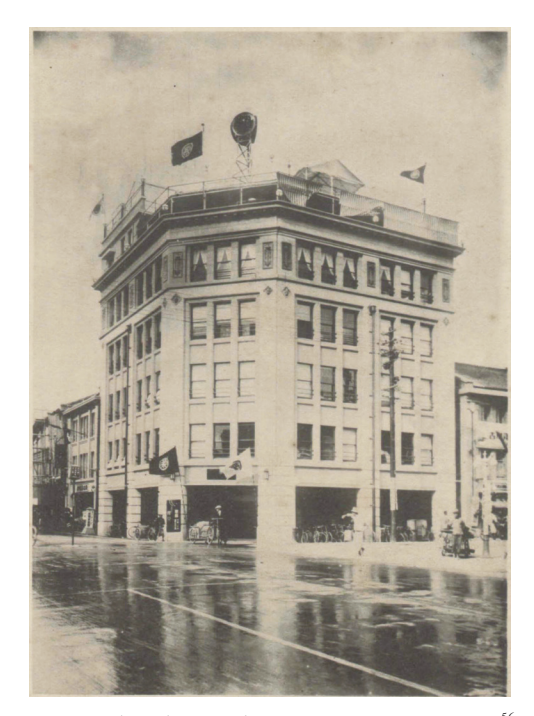
Figure 3. The Kikumoto department store, Taipei, 1932.<sup>56</sup>

The 1930s witnessed another wave of rapid development in the market for mass consumers, and the fever for mass consumption also spread to Taiwan. On 11 December 1932, the Utsumi family paid a visit to the first modern department store in Taiwan, Kikumoto 菊元, which had just opened in Taipei two weeks before on 28 November. Kikumoto was a seven storey building (including observatory), equipped with the latest elevators ascending to the fifth floor where the dining area was located. Though Utsumi only visited Kikumoto when he travelled from Xinzhu to Taipei, his diary shows that the new department store had already entered his life.