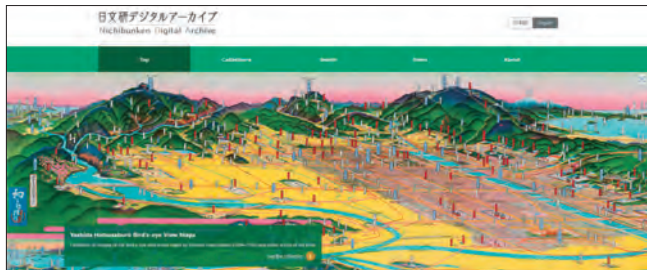
The Nichibunken Digital Archive