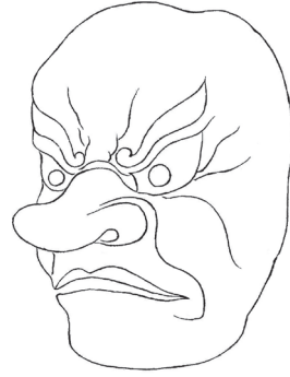
Figure 1. Mask of Sarutahiko used at the Mito Tōshōgū. Height: 19.5 cm; width: 13.5 cm. From Takaashi rikishi no men 高足力士之面.

On 4/17 Tamura’s men and others assembled for the glorious Mito Tōshōgū festival. This extravaganza included a huge parade with two “lion” masks and a cortege of many floats and other attractions provided by the citizenry. 34 Here the masters probably played the “lions” and purified the way of the parade, two important roles in any religious pageant.