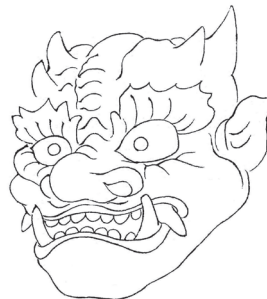
Figure 3. Mask of Takemikazuchi no mikoto used at the Mito Tōshōgū. From Takaashi rikishi no men .