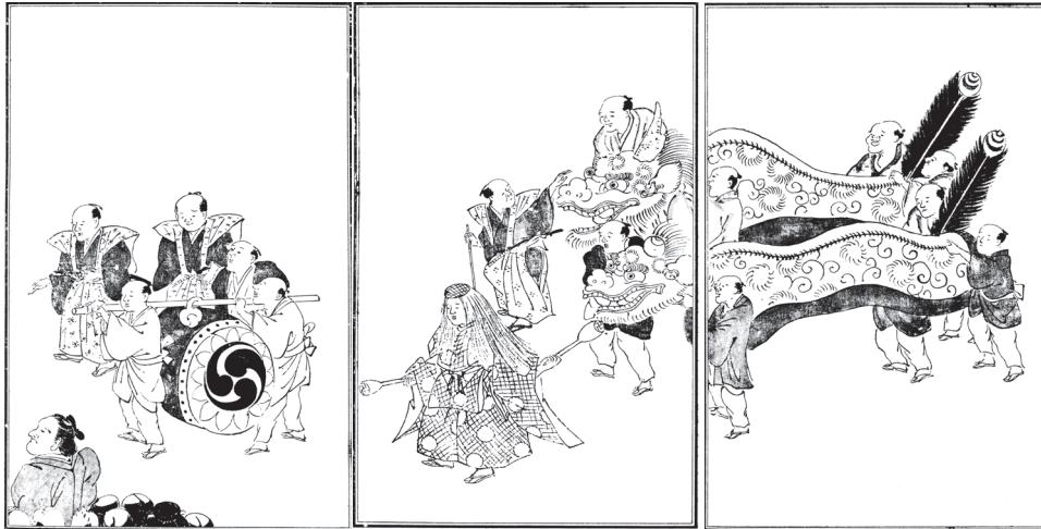
Figure 4. The “lions” and drummer of the “Sanja festival” parade. From Matsudaira 1942, pp. 386–88.

Some three months later, on 3/17–18, came the Sanja festival, the major Sanja Gongen celebration, one that honored the three mythical founders of Sensōji, the two fishermen and brothers Hinokuma Hamanari 檜前浜成 and Hinokuma Takenari 檜前竹成 and their headman Haji no Mahito Nakatomo 土師真人中知. During the seventeenth century, this festival was staged biennially, although a “minor festival” limited to temple grounds was produced in alternate years. From the late eighteenth century the festival was plagued by incessant cancellations and postponements. Whether a grand fête actually took place or not, on 3/17 Tamura and his men performed kagura and dengaku (here known as binzasara after the percussion instrument that accompanied it). The day’s program began with three “lion dances” and then moved to four binzasara dances. The two “lions,” one male and one female, saluted the four directions within the Sanja shrine hall, thereby “fortifying the land” (Figure 4), while the entire performance was designed to ensure good harvests, protect all from evil and disease, and charm the ears and eyes of spectators, divine and human. 59 Here again Tamura avoided mentioning dengaku in his roster of arts, in favor of a kagura style he claimed to monopolize.