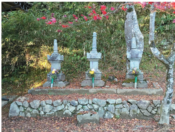
Figure 4. Grave markers for Takauji (L), Kiyoko (C), Nariko (R). Ankokuji (Kōfukuji), Ayabe City.