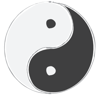
Figure 5 Yin-yang diagram

Taiji (yin-yang) diagram of the Chinese Daoist tradition. Today's view of the founding of the universe, too, inclines less to the notion of the creation by a divine being out of nothing, than to the possibility that it was nothingness itself that led to the formation of the cosmos. Quantum theory has it that nothing ( mu ) is actually not completely empty but incorporates indeterminacy, which is close to the Daoist idea of “mu” (Ch. wu ). It may be useful to take a new look at the Buddhist idea of insubstantiality ( mujittai ).