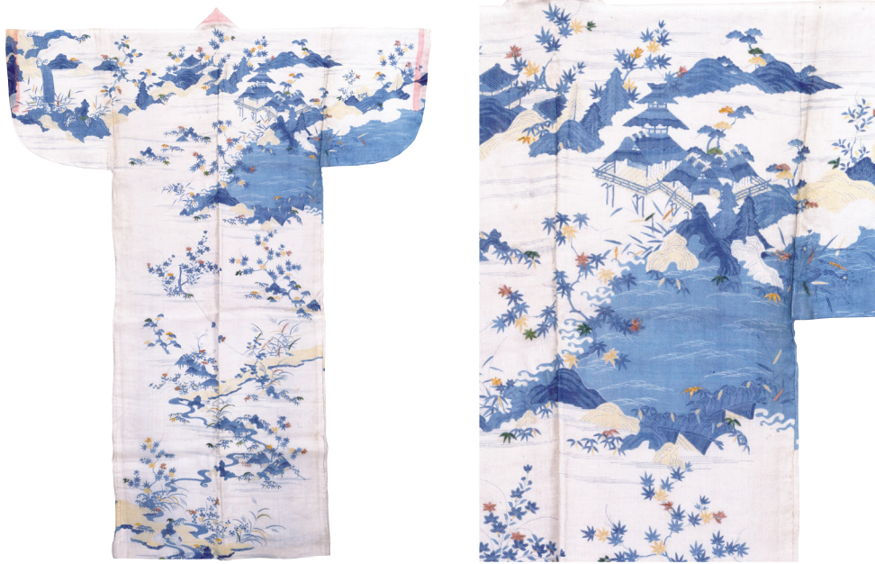
Figure 3. An eighteenth century summer kimono ( katabira 帷子) featuring the chaya'tsuji motif. Tokyo National Museum 1983, Rōkaku ganryūsui mon'yō 楼閣岩流水模様, no. 3866.

for the shara with which he arranged his pictures. 47 Chaya'tsuji typified the developments that took place in the course of the seventeenth century when the wordplay of shara entered applied arts and crafts to enhance and deepen the enjoyment, the aji of designed motifs. The multi-layering of allusions, read from the motifs strengthened this taste, the shara'aji , as explained by Figure 3. The thatched pavilions ( tomaya 苫屋) at a deserted seashore may have pointed to the poetic loneliness expressed in such classics as Fujiwara no Teika's poem " Miwataseba... ," but other associations remained open. One of the pavilions is a multi-storied, thatched pagoda-like structure and could be pointing to a Chinese legend, in which a shinkirō comes up from a hamaguri shell. Letting the eye travel leisurely over the motifs was the way to appreciate their phantasmagorical poetic space.