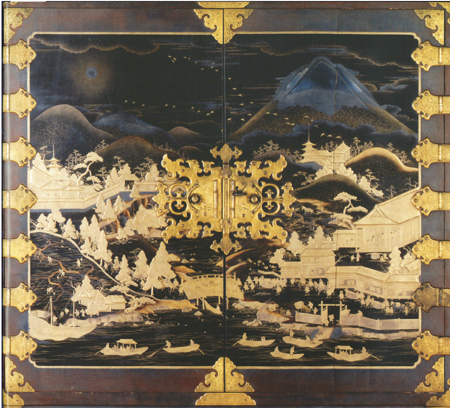
Figure 4. The decoration on the front panel of a lacquer cabinet in the Royal Collection, Netherlands, shows landscape scenery. One from a set of two in the Collection Huis ten Bosch, supposedly acquired by Van Hogenhoek. 70 Illustration from Trousselle 2008, p. 113.

Landscape representation in Japan had already a well-established canon of literary pictorial imagery that elicited moods and memories that had been—and could be expressed once more—in poetry, prose, art, or in garden design. 71 This thematic landscape representation was expanded in the seventeenth century to include the layering of riddle and association of shara . Lacquer ware craftsmen had successfully complied with the demand for such added fabrication by art producers like Kōetsu, but were now confronted with Dutch requests for representations of topographical landscape scenes, including foreign travelers themselves. Artistically speaking, this was a new challenge to their understanding and mastery of shara'aji , as the pictorial had to be adapted to European ideas. Naturally, the