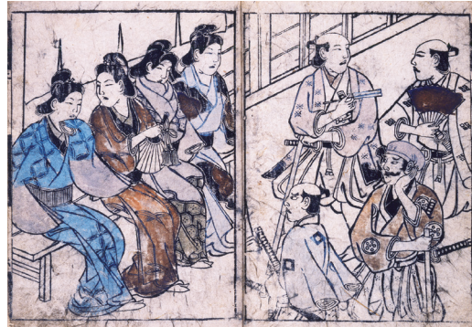
Figure 1. Appreciating and evaluating attitude, style, showy dress, manners, and speech, in short judging shara , were an important aspects of a visit to an entertainment district. It was a reciprocal thing between ladies of pleasure and their clients, as humorously shown in a color wood block in the style of Hishikawa Moronobu. Takabyōbu Kudamono katari 高屏風くだ物かたり. 1660. Collection of Tenri University Library.

This frivolous mood of the floating world hardly changed with the Great Meireki Fire of March, 1657 that razed almost three quarters of the capital Edo. Many precious kimonos were lost in the fire, unbalancing kimono business throughout Japan. To counter a foreseen collapse in the market, the Edo bakufu took measures to curb luxurious spending on clothing; maximum prices were set and imports were prohibited. In efforts to overcome these restrictions, kimonos became lavish in design rather than material. Motifs covered the cloth from shoulder to foot in audacious asymmetry, exposing a lot of white, saving expensive dye material; an added meaning was doing things just as you