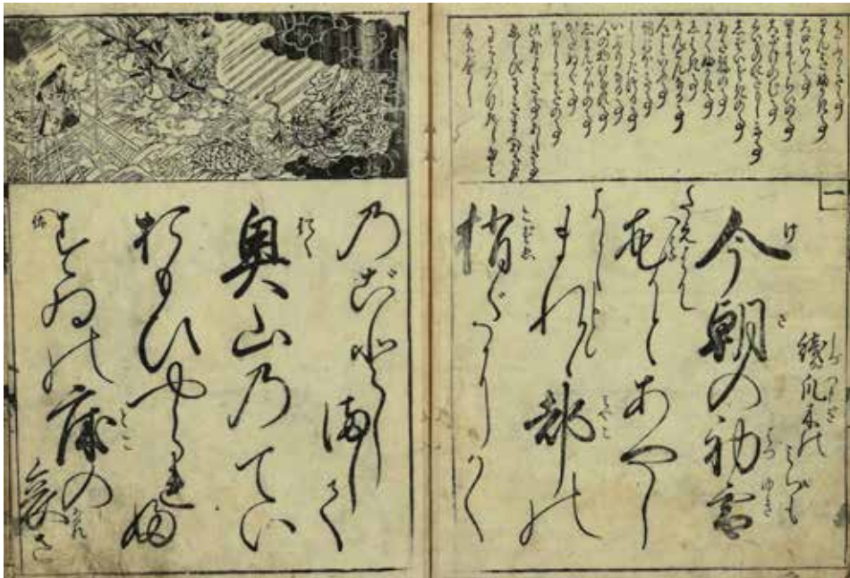
Figure 2. Two opposing pages from Models of Writing for Women ( Onna-yō bunshō kōmoku , 1698), including an image of Atsuta no En'uneme and a great snake (upper left).

for Women and Children) in cooperation with the Osaka publisher Murai Kitarō 村井喜太郎. 17 The relationship between Shibukawa and Murai is unknown, as are their relative contributions to Correspondence for Women and Children . Unlike Models of Writing for Women , Correspondence for Women and Children contains a complete illustrated edition of Nijūshikō (although without the Chinese verses that appear in the Saga-bon and Companion Library printings of the work; figure 3), as well as illustrated editions of Hyakunin issshu ; Ise monogatari 伊勢物語 (Tales of Ise); Hachikazuki (although in a different textual line than the Companion Library version of the work); and the kanazōshi Usuyuki monogatari 薄雪物語 (The tale of Usuyuki, 1615 or before). 18 In addition, Correspondence for Women and Children includes poems and portraits of the Sanjūrokkasen 三十六歌仙 (Thirty-six poetic geniuses), Fujiwara no Kintō's 藤原公任 eleventh-century selection of the greatest poets of the Nara and early Heian periods; the iroha いろは poem, by which the order of the Japanese syllabary was learned; and a section of model correspondence. As Yamamoto Jun has observed, and as we can see from a simple description of the book's contents, Correspondence for Women and