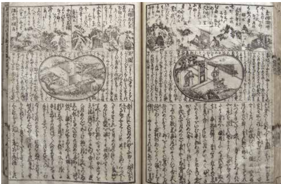
Figure 4. Two opposing pages from A Treasure Box of Learning for Women ( Onna daigaku takarabako , 1814 edition), including the Nijūshikō biographies of Kyō Shi (Jiang Shi, middle right) and Go Mō (Wu Meng, middle left).