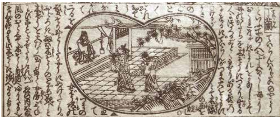
Figure 12. Tei Ran (Ding Lan) venerates his mother's statue. From A Treasure Box of Learning ( Onna daigaku takarabako , 1814 edition). Author's collection.