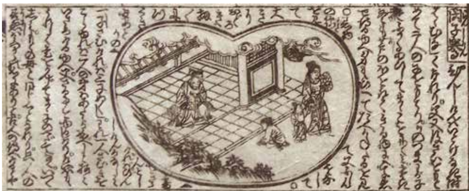
Figure 7. The biography of Bin Shigen (Min Ziqian). From A Treasure Box of Learning for Women ( Onna daigaku takarabako , 1814 edition).