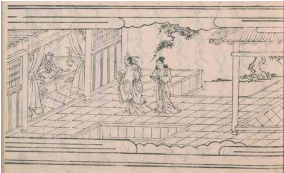
Figure 11. Tei Ran (Ding Lan) venerates his mother's statue. From the Companion Library edition of The Twenty-Four Filial Exemplars ( Nijūshikō , prior to 1729).