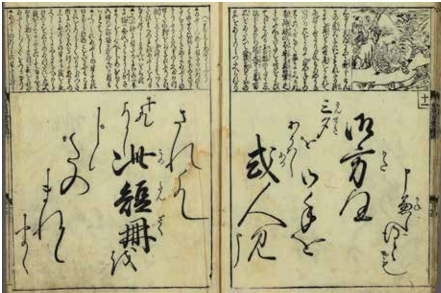
Figure 8. The biography of Yō Kyō (Yang Xiang, top). From Models of Writing for Women ( Onna-yō bunshō kōmoku , 1698).

Meeting a white-browed tiger deep in the mountains, she strikes with all her strength at its rancid breath. Father and child together, without harm, escape the clutch of its ravenous maw.