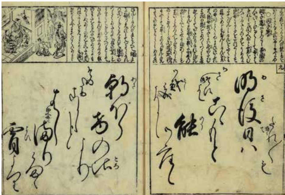
Figure 6. The biography of Bin Shigen (Min Ziqian, top). From Models of Writing for Women ( Onna-yō bunshō kōmoku , 1698).