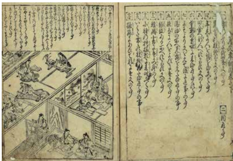
Figure 5. The first two pages of Models of Writing for Women ( Onna-yō bunshō kōmoku , 1698), including the table of contents (right).

Writing for Women , it is reasonable to suppose that he considered them to have particular significance for women.