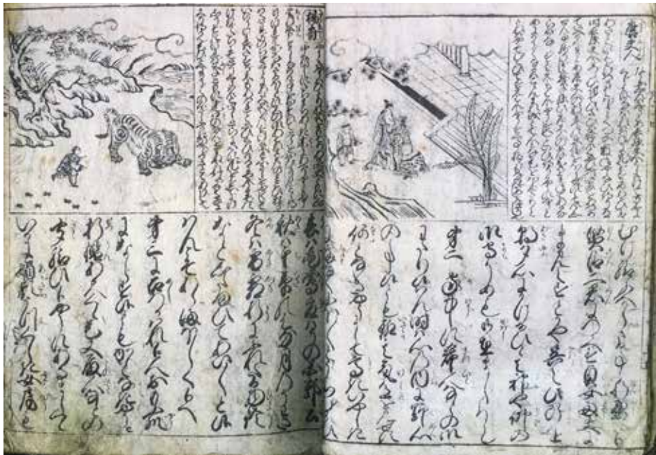
Figure 3. Two opposing pages from Correspondence for Women and Children ( Onna dōji ōrai , 1715), including the Nijūshikō biographies of Tō no Bujin (Tang Furen, upper right) and Yō Kyō (Yang Xiang, upper left).