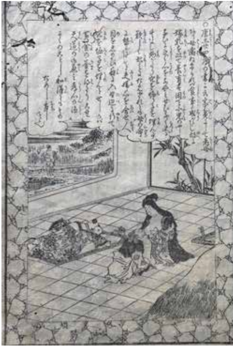
Figure 10. Tō no Bujin (Tang Furen) breastfeeds her mother-in-law. From A Celebration of Teachings from the Classic of Filial Piety for Women ( Jokun kōkyō oshie kotobuki , 1822). Author's collection.

This seems to be one of the points made by the kokugaku 国学 scholar Tajiri Baiō 田尻梅翁 (1731–1808) in his Jokun kōkyō oshie kotobuki 女訓孝経教寿 (A celebration of teachings from the classic of filial piety for women), which was simultaneously published in Kyoto, Osaka, and Edo with a preface dated Bunsei 文政 5 (1822). 44 Although its main part constitutes a Japanese translation of Nu Xiaojiao 女孝経 (The women's classic of filial piety), attributed to Zheng Shi 鄭氏 of the Tang Dynasty (618–907), Jokun kōkyō oshie kotobuki includes in its front matter a single-page illustration of Tō no Bujin breastfeeding her mother-in-law while her child sleeps to the side. The accompanying anecdote, which is inscribed in the upper part of the image, combines Tō no Bujin's story with that of Kaku Kyo and his wife: