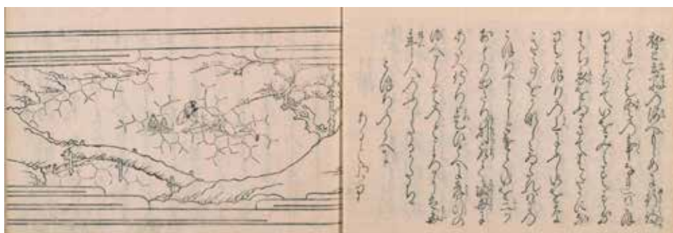
Figure 1. Ō Shō (Wang Xiang) uses his warm body to melt a hole in a frozen stream. From the Companion Library edition of The Twenty-Four Filial Exemplars ( Nijūshikō , prior to 1729).

how to read the Chinese as Japanese), and each with its own illustration. As a collection of short, unconnected anecdotes, rather than a single sustained narrative, it reads more like an anthology of medieval setsuwa 説話 tales than a typical otogizōshi . The unknown medieval translator took liberties with the work, changing significant details and in some cases altering the plots of stories, and for this reason the Japanese Nijūshikō should be considered both as a loose translation and as an independent work of medieval Japanese fiction.