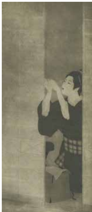
Figure 2. Uemura Shōen 上村松園, Yūgure 夕暮 (Twilight; 1941). Collection unknown. In Sansai 三彩, ed. Sansai 2 (1946), p. 10.

metsubōron rhetoric, however, was followed by the formation of a pictorial corpus of more radically Westernized nihonga by those of both older and younger generations.