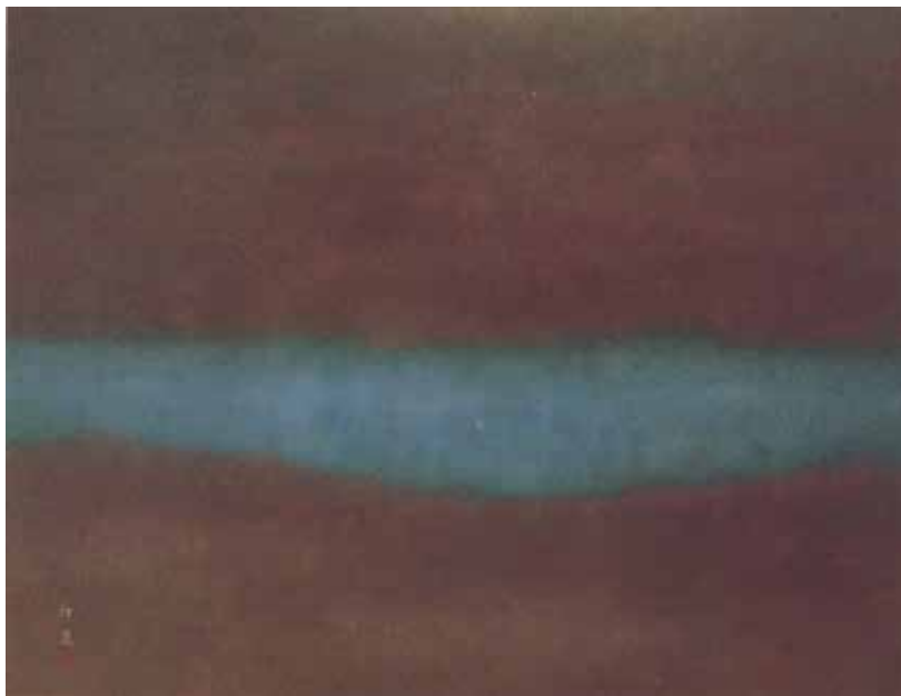
Figure 5. Tokuoka Shinsen 徳岡神泉, Nagare 流れ (Stream; 1954). 137.0 x 170.0 cm. Collection of Kyōto-shi Bijutsukan 京都市美術館. In 1950 nendai Kyōto no nihonga: Nenshō no toki 1950年代京都の日本画: 燃焼の時代, ed. Kyōto-shi Bijutsukan. Kyōto-shi Bijutsukan, 1990, p. 18.