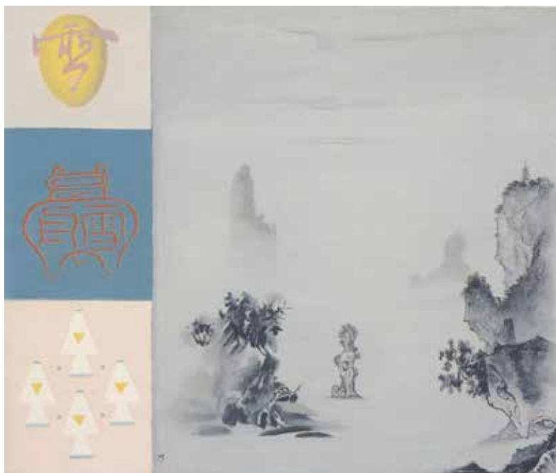
Figure 1. Kitawaki Noboru 北脇昇, Sesshū paranoia zusetsu 雪舟パロノイア図説 (Explanatory diagram of Sesshū's paranoia; 1947). 60.6 x 72.0 cm. Collection of Tōkyō Kokuritsu Kindai Bijutsukan. In Tōkyō Kokuritsu Kindai Bijutsukan 1997, p. 125.

Centrist pictorial propositions combining elements of Japanese and Western painting, however, are much longer in evidence before the advent of modernism.