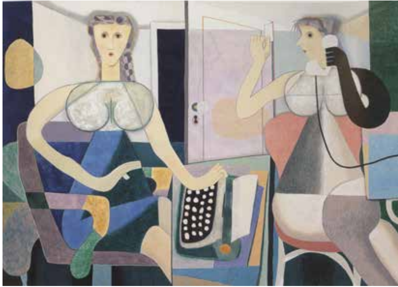
Figure 3. Dōmoto Inshō 堂本印象, Hachi jikan 八時間 (8 Hours; 1951). 130.0 x 160.0 cm. Collection of Kyōto Furitsu Dōmoto Inshō Bijutsukan 京都府立堂本印象美術館. In Chō "nihonga" modanizumu 超「日本画」モダニズム, ed. Kyōto Furitsu Dōmoto Inshō Bijutsukan. Kyōto Furitsu Dōmoto Inshō Bijutsukan, 2008, p. 22.