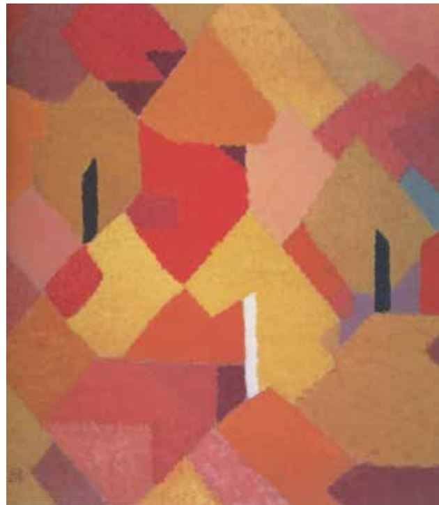
Figure 8. Higashiyama Kairi 東山魁夷, Kōyō no tani 紅葉の谷 (Autumn valley; 1952). 57.5 x 51.5 cm. Collection of Nagano-ken Shinano Bijutsukan, Higashiyama Kairikan. In Yokohama Bijutsukan 2004, p. 56.