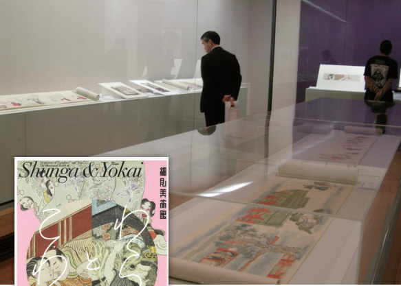
At the Hosomi Museum Kyoto 細見美術館での展覧会風景