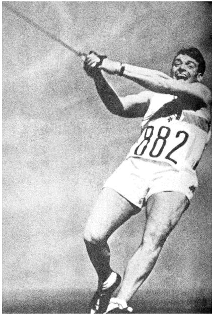
Figure 1. “Tettsui nage” (Hammer-Throw). As reproduced in Murano 2004. Photo depicting the German athlete Karl Hein. Source: Leni Riefenstahl. Schönheit im Olympischen Kampf . Deutscher Verlag, 1937.

10 鉄鎚投 御覽 鉄が掃く世界の中で しぼらく震れな電動機が喘い てゐる 白い円の中に握まられて