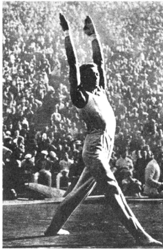
Figure 2. “Taisō” (Gymnastics). As reproduced in Murano 2004. Photo depicting Walter Steffens of the German gymnastics team.

僕には愛がない 僕は権力を持たぬ 白い襟衣の中の個だ 僕は解体し、構成する 地平線がきて僕に交 ま る 僕は周囲を無視する しかも外界は整列するのだ 僕の咽喉は笛だ 僕の命令は音だ